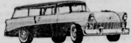
"Two-Ten" Handyman— 2 Doors, 6 Passengers