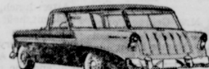
Bel Air Nomad— 2 Doors, 6 Passengers