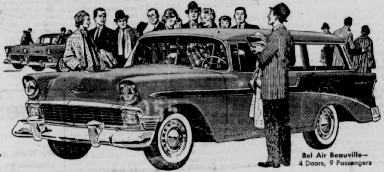
Bel Air Beauville— 4 Doors, 9 Passengers

Chevrolet offers you a choice of six sprightly new station wagons—including two new 9-passenger models—all with beautiful Body by Fisher, all with plenty of cargo space, all with new horsepower ranging up to a hot 205!