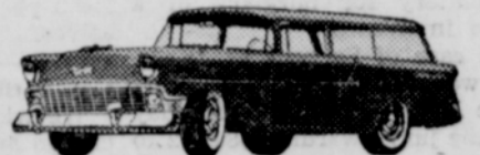
"One-Fifty" Handyman— 2 Doors, 6 Passengers