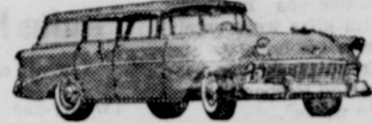
"Two-Ten" Beauville— 4 Doors, 9 Passengers

Here's a zippy, exciting kind of power that's fun to handle. And the closest thing to sports car performance—split-second steering reaction and the knack of holding fast around curves—that you'll find in a full-size automobile. Seat belts, with or without shoulder harness, and instrument panel padding, are optional at extra cost. Safety door latches and directional signals are standard. Come in soon and drive a real road car!