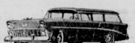
"Two-Ten" Townsman— 4 Doors, 6 Passengers