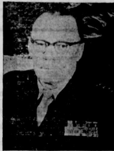
WASHINGTON, D.C. (PHOTO)— General Randolph McCall Fite assumed duties as the 21st commandant of the Marine Corps January 1. He succeeds General Lemuel C. Shepherd, Jr., General Pate, a Marine since 1921, is a combat veteran of Santo Domingo (1923-24); Guadalcanal-Tulagi, Palau, Iwo Jima, and Okinawa during World War II, and commanded the 1st Marine Division in Korea.