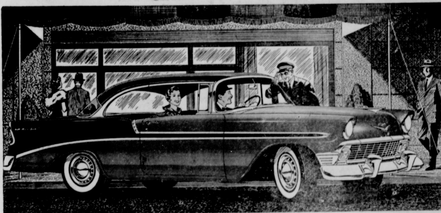
THE NEW BEL AIR SPORT COUPE

You wouldn't mistake this new Chevrolet for a high-priced car!