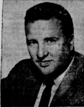
HENRY FORD II Chairman, Board of Trustees The Ford Foundation