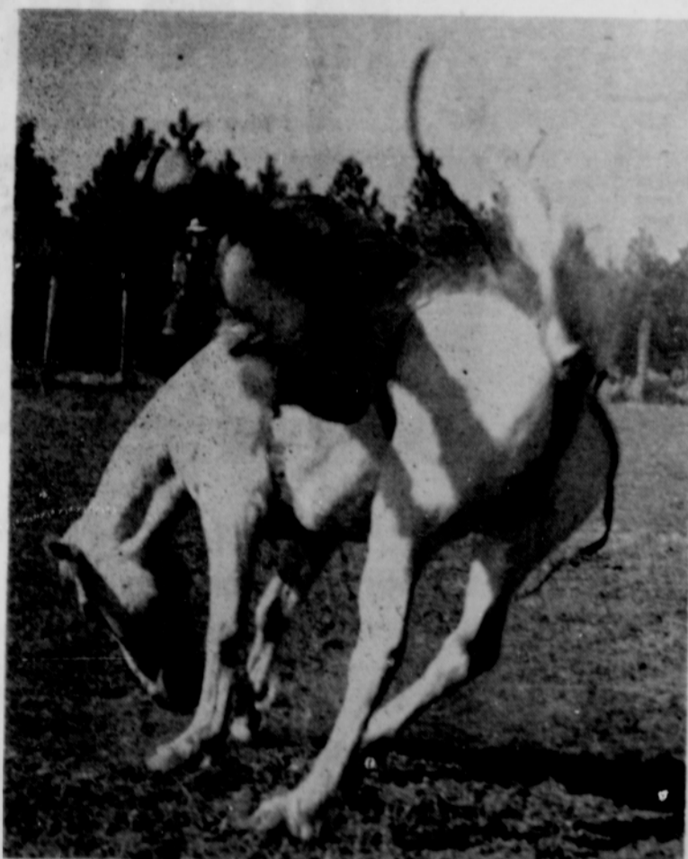
WHAT'S GOING ON—OR OFF—HERE?

It is so popular that it is almost impossible to run a fair without it. The customers sit on their hands at less exciting performances, a physical feat not done by anyone when a horse is bucking. He may deery bucking at other times and shout like an exultant kid as the rider