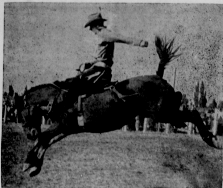
LOOKS LIKE MAN CONQUERS HORSE

The same men follow a certain outfit and its saddle brones until they know the quirks and twists of every horse in it—and get thrown just the same. Some are done when they read the slip carrying the name of the horse they are to ride—they never regain confidence. For that's the way it is—you draw him, you ride him.