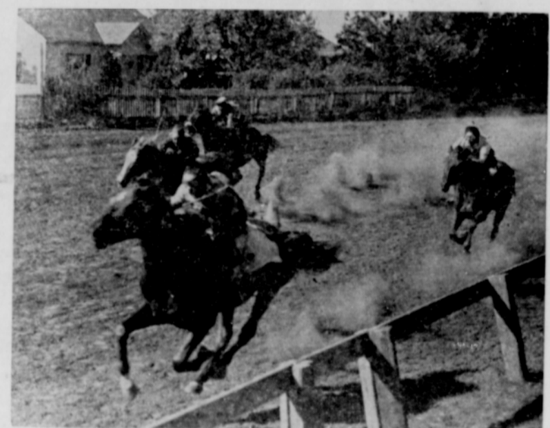
RACING PONIES MAKE FOR EXCITEMENT

reaches for a shoulder with his spurs and scratches up a yard of sod.