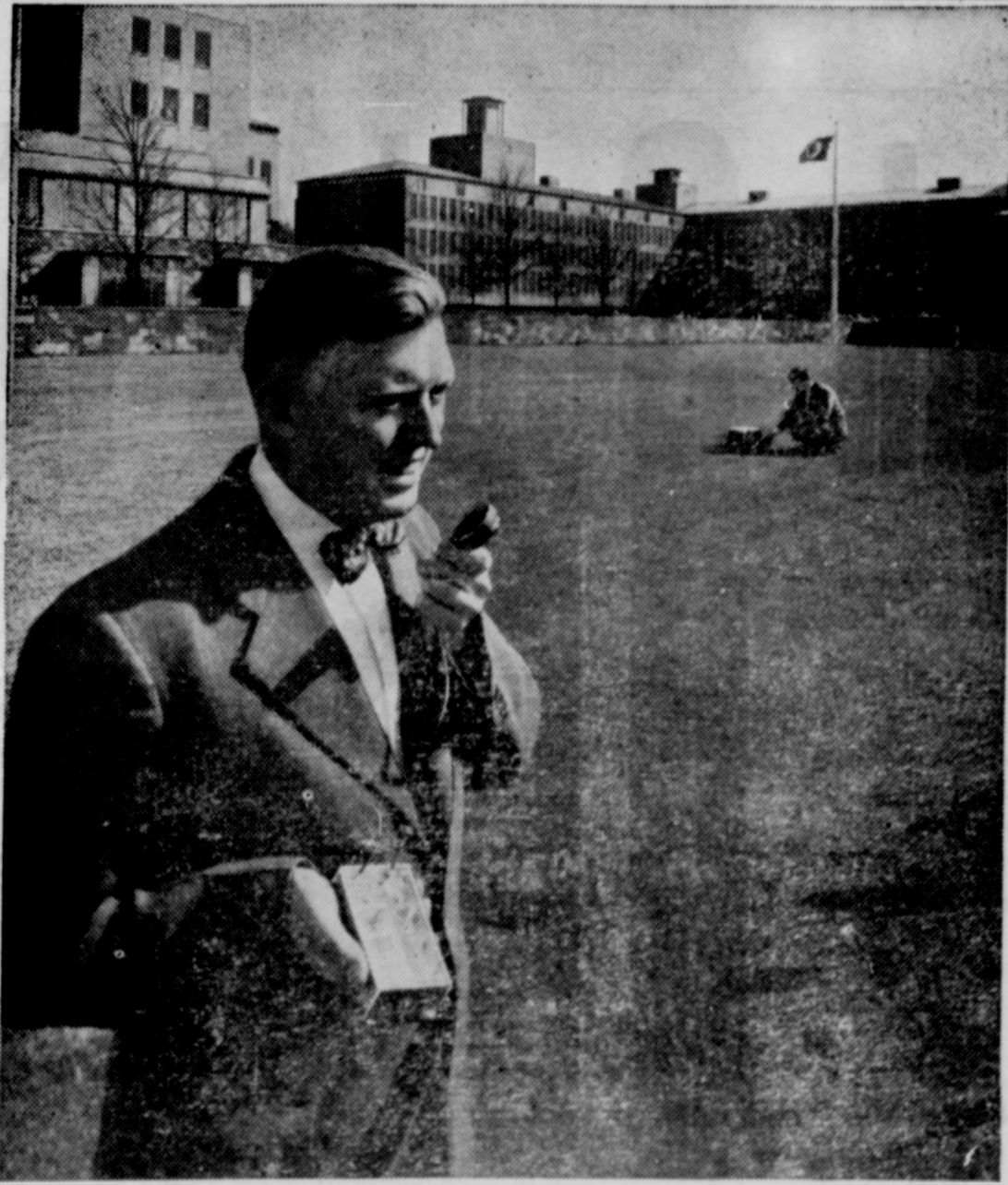
A radio powered by sunlight. Man's centuries-old dream of getting power directly from the sun has come true at last. Bell Telephone Laboratories has built a solar battery that directly and efficiently turns sunlight into usable electricity. Made of highly purified silicon—which comes from common sand—the Bell solar battery can run a small radio set (above) or send voices over telephone wires. Telephone people are still testing it. But chances are good that, once they finish, the Bell solar battery will offer great opportunities for improvement and economies in telephone service. Research like this helps us bring better service to more people at the lowest possible cost. Pacific Telephone.