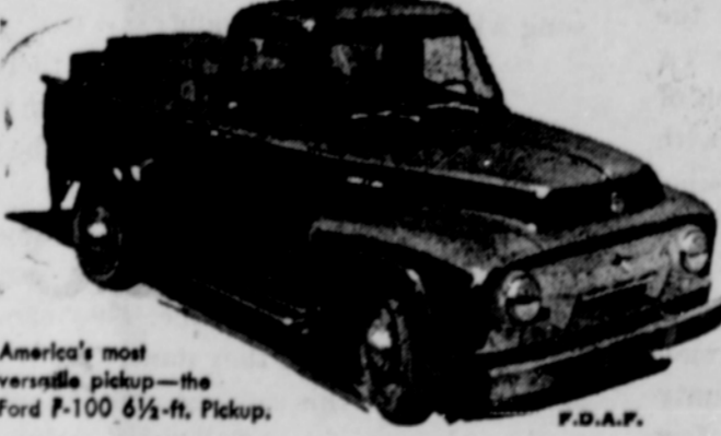
America's most versatile pickup—the Ford F-100 6 1/4-ft. Pickup.

Now is the best time to get the best deal—and you'll get it from your FORD DEALER!