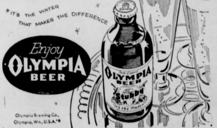
Olympia Brewing Co., Olympia, Wn., U.S.A.

Olympia just naturally belongs whenever good friends get together. Stock up on the beer with the rare ingredient.