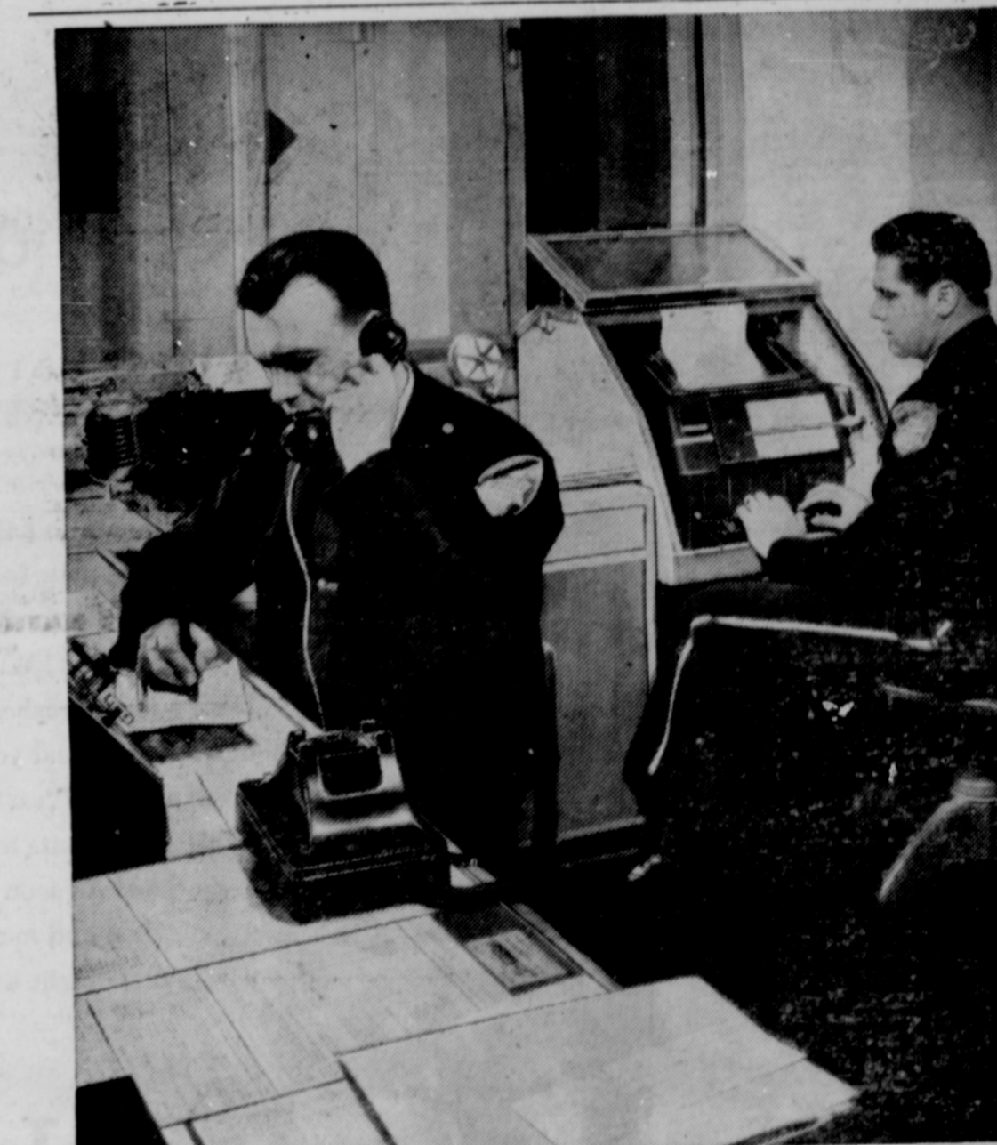
Police dragnet in action. Hundreds of city, county, state and Federal law-enforcement agencies in the West are linked by Pacific Telephone's teletypewriter service. They use it to exchange information on wanted persons, stolen cars, and other urgent matters. Some agencies use our regular teletype service. Others use private networks we provide for them. Working with Western law-enforcement agencies is, of course, another way we serve you. And in this part of our job, as in all others, we try to furnish the best possible service at the lowest possible cost. Pacific Telephone works to make your telephone a bigger value every day.