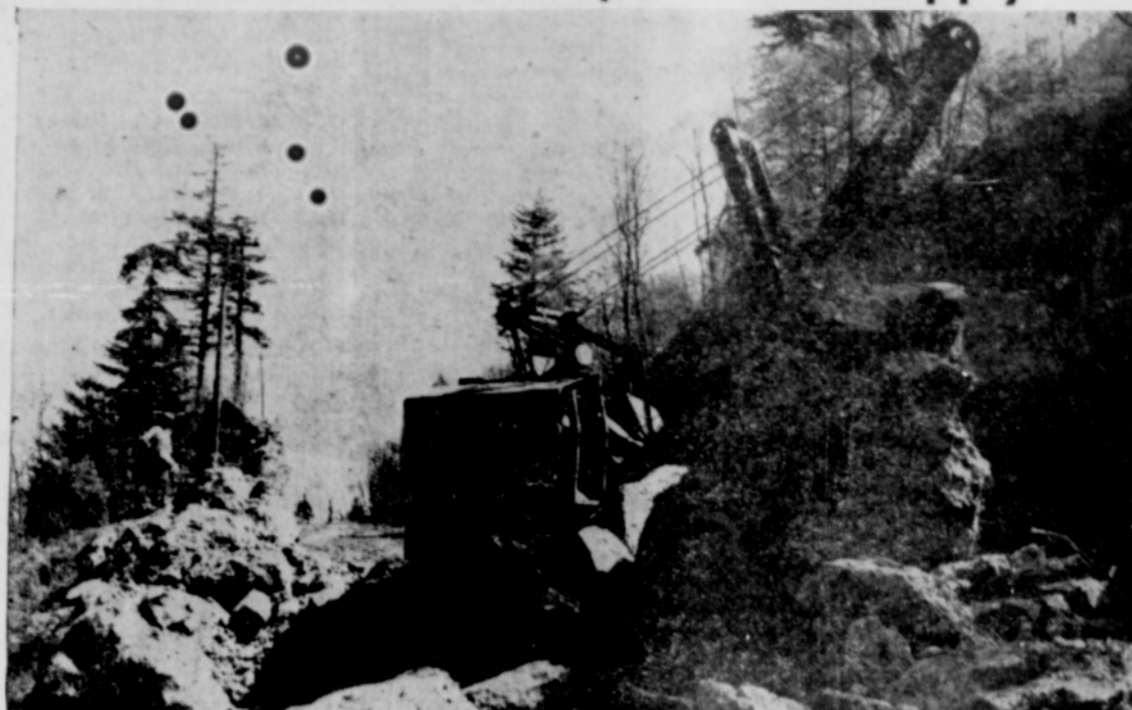
The days of Samuel Lancaster and the other Highway Pioneers, the scenic loops and curves and grades of the Columbia Highway were built far above the river, with picks and shovels, mules and men; also black powder, star drills and a sledge. But, when the Moderns ironed out the curves, took the grades down along the water-route and blasted their way through the foot of the bluffs, they did it with huge suction dredges, dynamite, bulldozers and diesel oil. They made the barn-sized boulders into base material to fill the low spots until now you never feel a bump when you ride the road between Dodson and Bonneville where the boulders blocked the way when the above picture was taken. Construction like that costs approximately a third of a million dollars per mile.