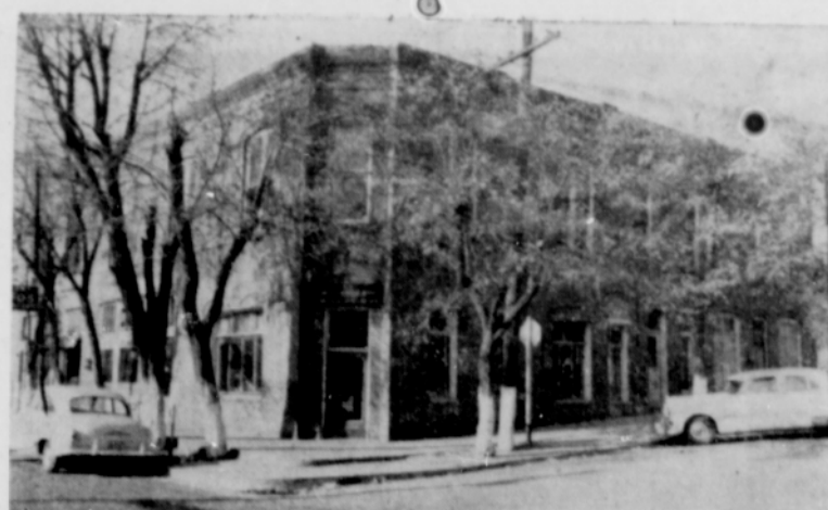
Shown above is the building by branch of First National Bank which housed the Sherman county of Portland for the past 15 years.

Rainfall so far this month and week has been about a third of an inch, the larger part falling Wednesday evening when a nice shower came. Prior to