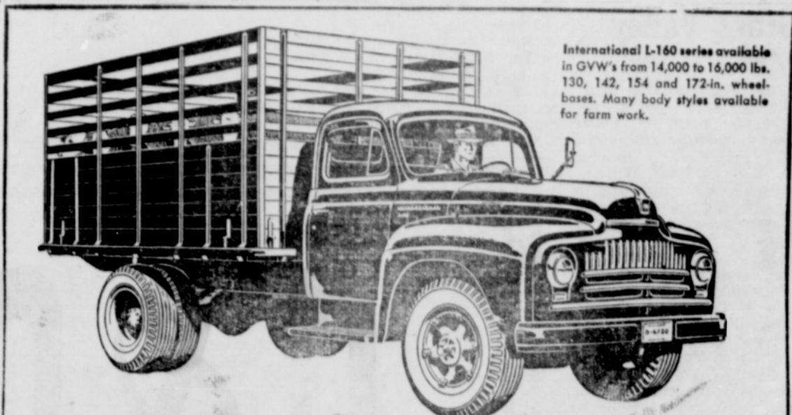
International L-160 series available in GVW's from 14,000 to 16,000 lbs. 130, 142, 154 and 172-in. wheelbases. Many body styles available for farm work.

HILL AND HILL KENTUCKY STRAIGHT BOURBON WHISKEY THIS WHISKEY IS 4 YEARS OLD - 86 PROOF THE HILL AND HILL CO., LOUISVILLE, KY.