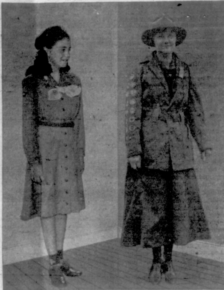
GIRL SCOUTS LOOK BACK 40 YEARS. More than a million and a half Girl Scouts in every state are celebrating their organization's 40th anniversary during 1952. Founded in Savannah, Ga., March 12, 1912, by Juliette Gordon Low, Girl Scouting has grown continuously in size and popularity through four decades. Although Girl Scouts today wear trim green uniforms instead of the bulky khaki outfits of yesteryear, they haven't changed much in their interests; home-making, camping, international friendship, nature study, and community service have always been favorite activities.