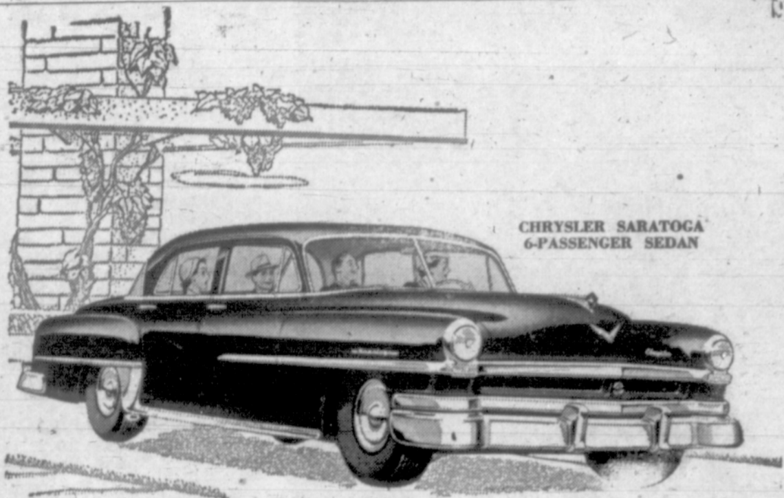
CHRYSLER SARATOGA 6-PASSENGER SEDAN

We recommend the NEW Du Pont DAIRY CATTLE SPRAY It's Safe to Use NEW: Contains Methoxychlor... the new insecticide. SAFE: When properly used, will not contaminate milk or butterfat. KILLS horn flies, stable flies, lice, fleas and mosquitoes. LONG-LASTING: Remains effective on animals at least three weeks; in buildings approximately two months. ECONOMICAL: 1-lb. enough for 32 head. EASY TO USE: Just mix with water. Get your DU PONT DAIRY CATTLE SPRAY 1 or 2-lb. packages. Baumgartner Hdw. & Electric Grass Valley, Oregon