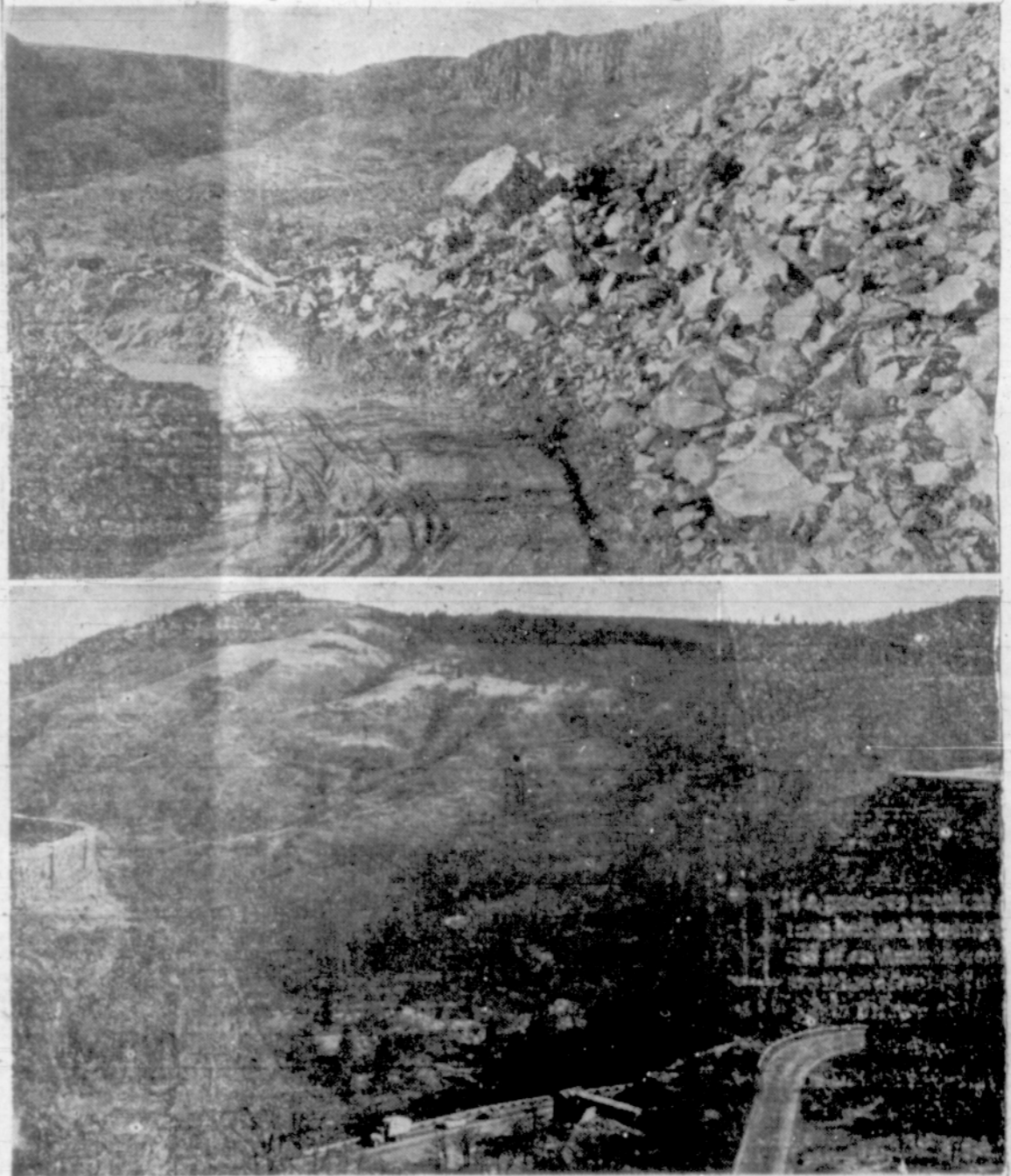
About eight miles west of The Dalles, Rowena Heights are up-reared on the South bank of the Columbia, a rugged barrier reaching practically from the river's edge to the crowning scenic point of Mayer Park some 747 feet above. When the early-day residents around The Dalles came down to Portland they took to the river boats to get around Rowena. Pioneering highway engineers got around by snuggling close to her curving shoulders and climbing up and down, loop on loop. It was the long way around and a scenic way but it ate up the gas and killed time and many persons didn't like it. The top picture shows the original highway, near the crown of Mayer Park before it was paved. The lower photo looks down at the "Rowena Loops" from close to the top. But now Rowena Loops are on their way out so far as major traffic is concerned. Initial contracts recently have been let for the construction of a water grade modern highway along the river at the foot of the cliffs. The new way is programmed to be completed in the late fall of 1953.

the Sherman County Fair queen contest Sunday.