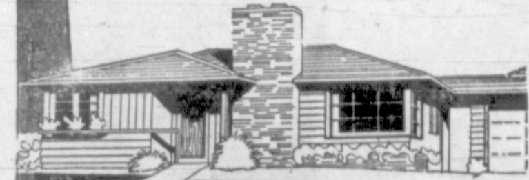
Celotex House No. 10 as Nationally Advertised

Your dream home... build it now this thrifty way