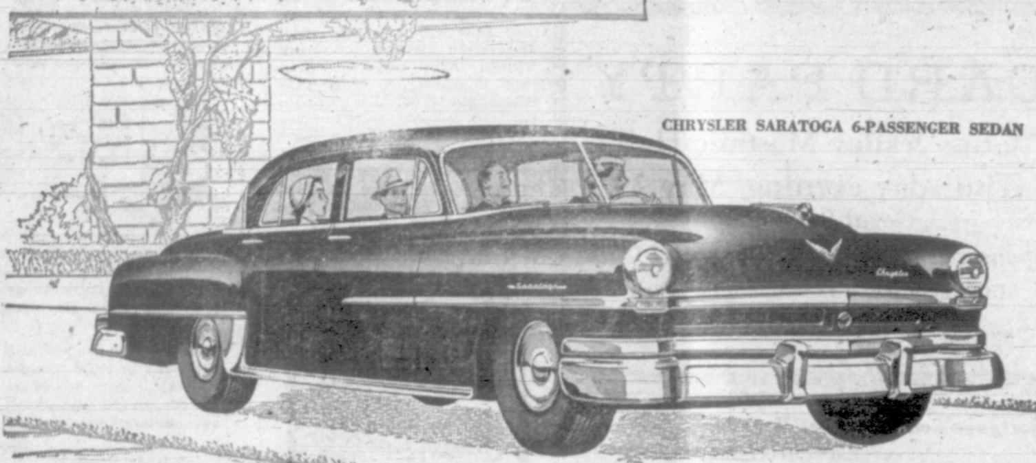
CHRYSLER SARATOGA 6-PASSENGER SEDAN

KENTUCKY BLENDED WHISKEY • 86 PROOF • 65% GRAIN NEUTRAL SPIRITS • THE OLD SUNNY BROOK CO., LOUISVILLE, KENTUCKY