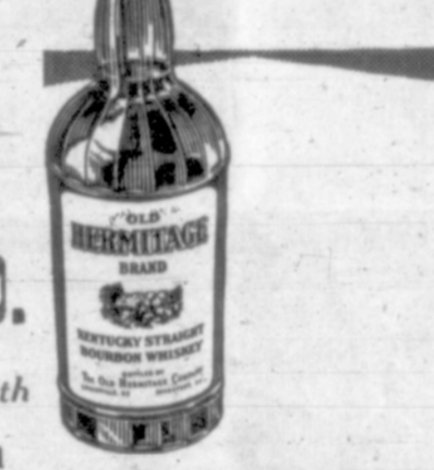
86 PROOF - THE OLD HERMITAGE COMPANY, FRANKFORT, KENTUCKY

reports. Ranges and pastures the better part of the month, supplies are expected to be adequate unless the feeding period are better than last month, but Supplemental feeding continued to run below last year's at a heavy rate in those areas. is greatly extended, local areas conditional average. Winter Hay supplies dwindled in face of exceptional. Moisture conditions ranges and pastures in eastern of the lengthening feeding period are generally considered excellent. Oregon were snow covered for iod. At this time, hay and grain lent.