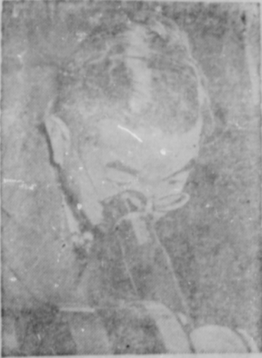
IMPERIAL PEER . . . Emperor Hirohito takes a peek into the electron microscope at a factory in Kyoto during his tour of that area. During his tour some university students mobbed his car singing Communist songs.