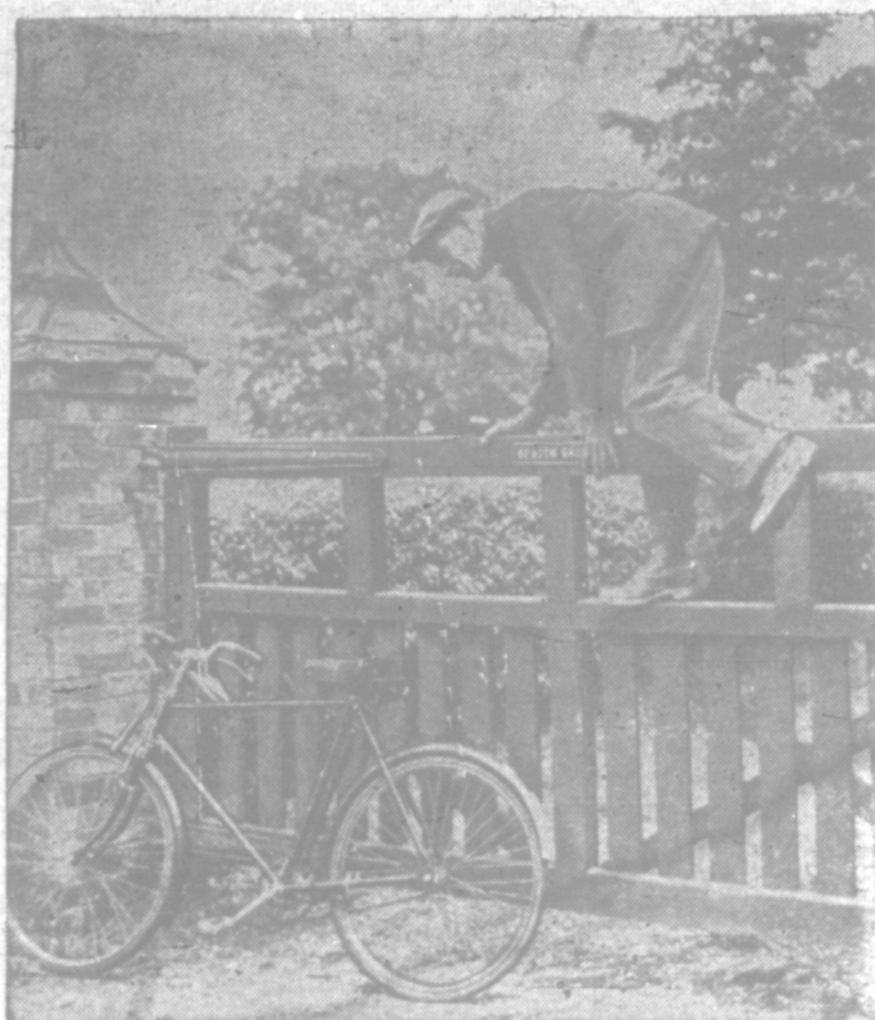
AFTER THE HORSE HAS GONE . . . The gardener at the Taisfield, England, home of Donald MacLean, missing British diplomat, climbs over the gate at the entrance to the MacLean grounds on his way home from work. The gate has been kept locked since the story of MacLean's disappearance hit the headlines. It was suggested to authorities that MacLean and fellow diplomat Guy Burgess were back in England, but there has been no proof.

Standard Insurance Co. A western company serving western agriculture HOME OFFICE Portland, Oregon 812 S. W. Washington Phone AT 4331