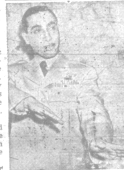
JET ACE TELLS STORY . . . Capt. James Jabara, Wichita, first jet ace by virtue of his fifth and sixth "kills" in Korea recently, addresses newsmen at a press conference in the Pentagon. He said the MIG-15 is as good as the F-86 as a combat airplane.