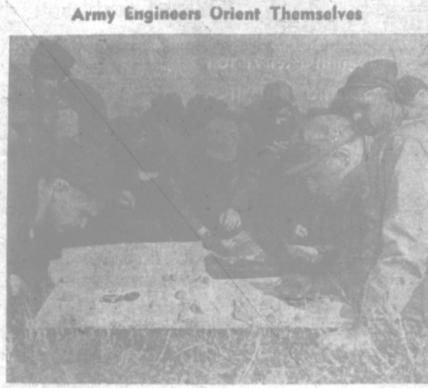
These troops are becoming familiar with the use of the compass in orienting their position on military maps. The outdoor class was recently conducted at Fort Leonard Wood, Mo., where the engineers, shown above, used the Army's standard pocket compasses which embody a device for "shooting an azimuth," or a straight line in a certain direction.