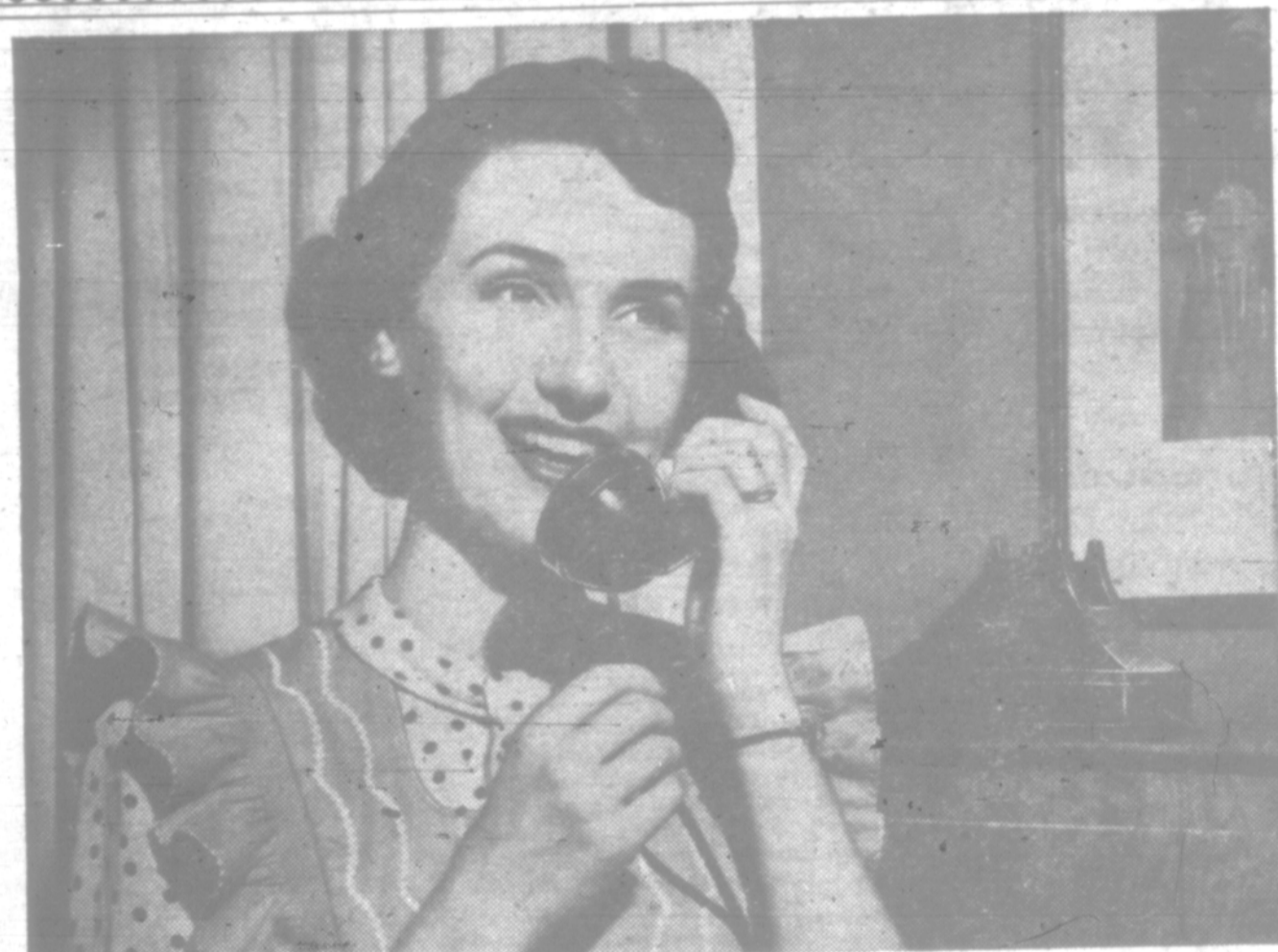
A mighty good friend of the family budget, your telephone offers more service than ever—at bargain rates.