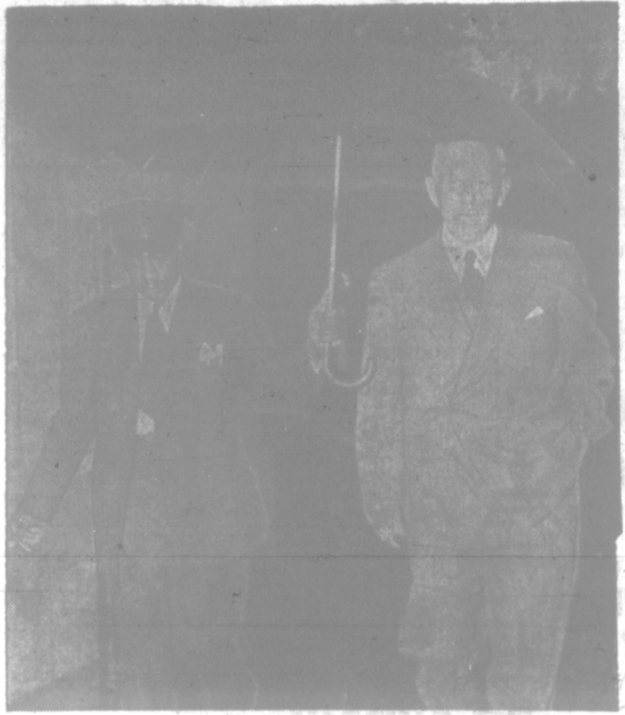
DEFENSE SECRETARY GOES TO WORK . . . Gen. George C. Marshall at Capitol for meeting with the senate armed forces committee on defense policies he will inaugurate as defense secretary. It took a special law to enable the general to become defense secretary, as that post called for a non-military man.

The Grass Valley grade football team defeated the Wasco grade team here Thursday after