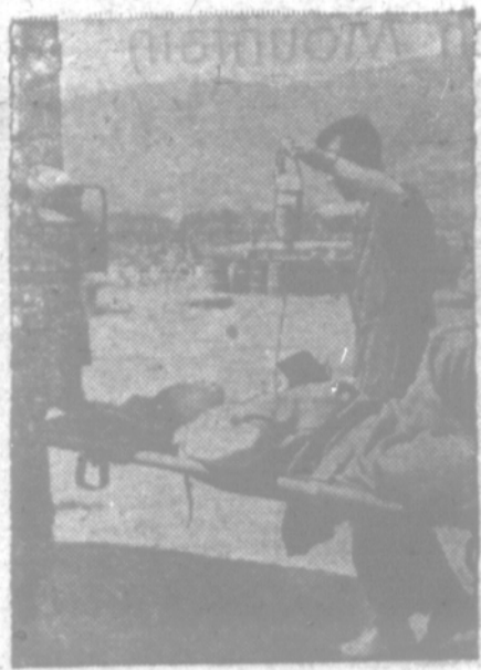
RACE AGAINST DEATH . . . A seriously wounded American soldier receives blood plasma after being evacuated from the Korean fighting front by air ambulance. The defense department did not specify at which fighting front the GI was hit.

A three act comedy, "Calm Yourself", will be presented at the Grass Valley pavilion Saturday November 18 at 8:00 p. m.