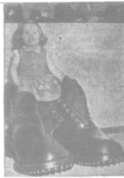
BIG BOOTS FOR LITTLE GIRL ... A Parisian tot sits happily in a pair of enormous boots on display at the "exposition of leather," which commenced recently. This is the first leather week to be held in France since World War II.

Pacific Power & Light Company 1910 • Our 40th Anniversary Year • 1950