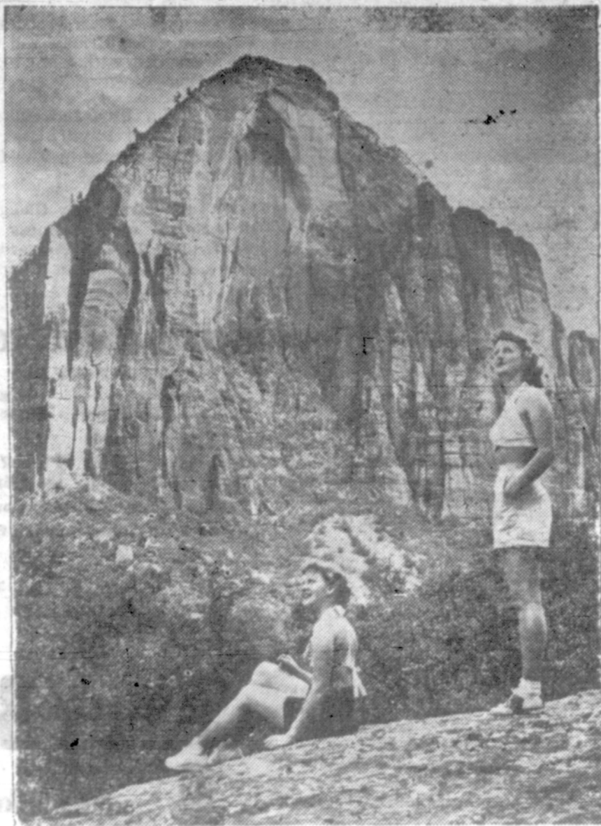
Background for the young summer visitors to Zion National Park in southern Utah is Red Arch Mountain. This huge mountain of red stone is used as an example of the way nature carves out colorful monuments that line the canyon walls. Geologists believe that some day this may be a tremendous natural bridge of bright vermilion stone carved out by the effects of erosion, wind and weather.