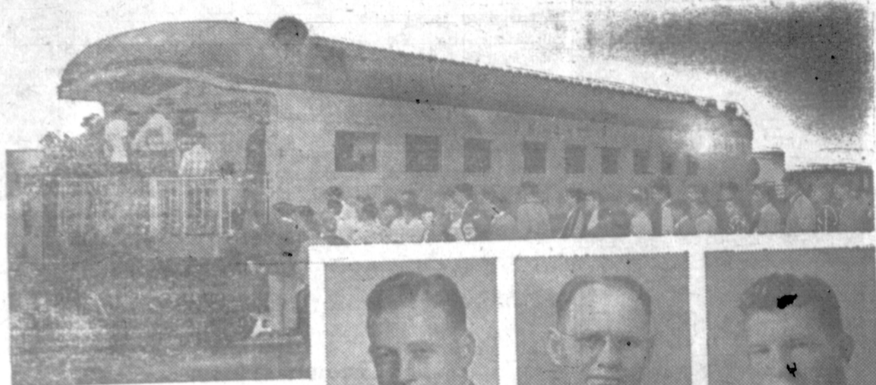
IMPORTANCE OF "GRAIN SANITATION" IS STRESSED ON CURRENT PACIFIC NORTHWEST TOUR OF UNION PACIFIC RAILROAD'S AGRICULTURAL CAR.