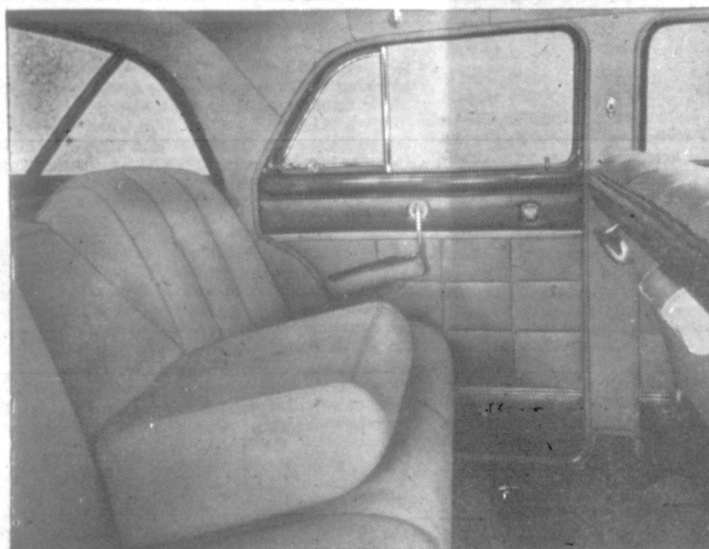
ONLY THE CHRYSLER IMPERIAL offers you this absolutely unique system of window control! Each window has its own separate electric motor... each one can be raised and lowered independently from the driver's seat or at the window itself. And that's not all! So many other de luxe features... the kind you think of as being in the "special order, extra cost" category... are STANDARD EQUIPMENT on the Chrysler

"Imperial," says Webster, means "superior excellence." IMPERIAL, says Chrysler, is this luxurious new car that excels anything on wheels in the sheer exquisiteness of its styling. Come look inside this reigning beauty... look at the lavish wool broadcloth fabrics, tastefully combined with topgrain leathers. Look at the lovely color harmonies, the soft sheen of the butler-finished chrome. Consider the advantages of Fluid Drive... exclusive new automatic transmission... Waterproof Ignition... Full Flow Oil Filter... High Compression Spitfire Engine... electric window lifts... the CLEARBAC rear window for exceptional driver vision... and dozens more. Surely, of all the world's fine automobiles, only the Chrysler CROWN IMPERIAL, this car's running mate, achieves the same aristocratic distinction. Come see the flawless workmanship, the fine materials, the superb Chrysler engineering... and you'll agree that no other car, at any price, compares with the Chrysler IMPERIAL. Inside or out, there is no finer car in America!