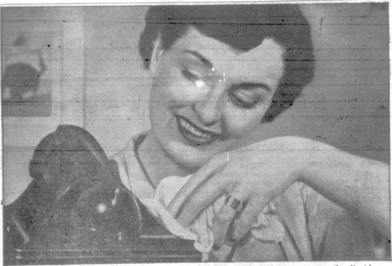
Best way to spruce up a telephone is with a soft, dry cloth...never with water, or any other liquid.