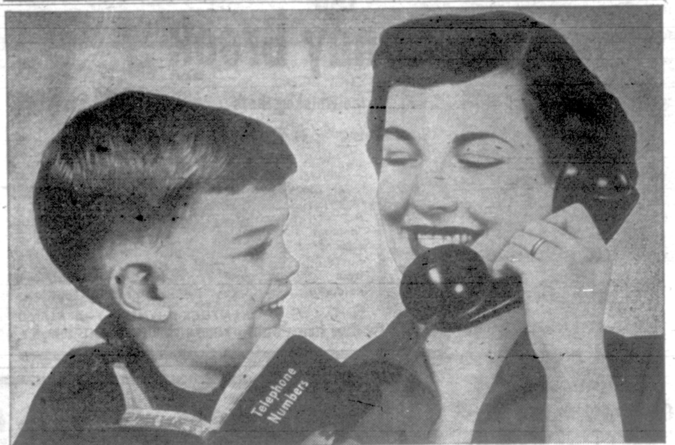
If you keep a list of out-of-town numbers, you'll find calls are put through much faster—often in 30 seconds.

Paid Political Advertisement By Sherman County Morse For Senator Committee