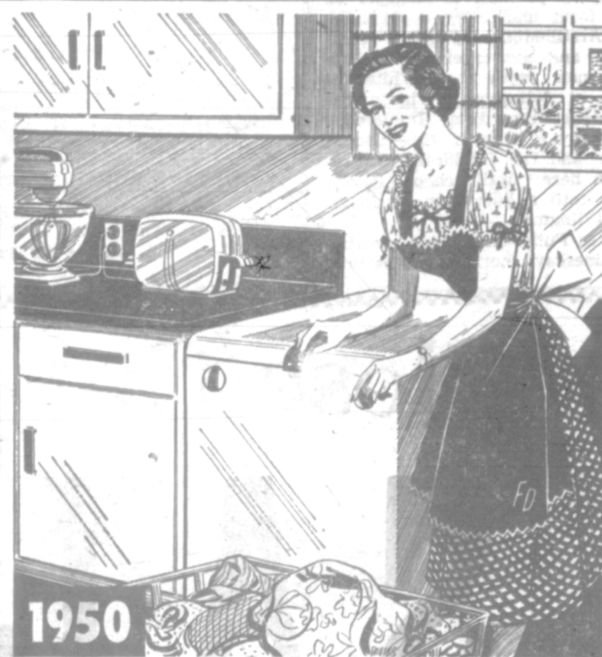
TODAY cheap electricity does the wash in short order. Upstairs and downstairs, electric appliances make life easier for the housewife. For 40 years, PP&L has been promoting new uses for electricity, improving service, reducing rates. Today homes served by PP&L use an average of 4,364 kilowatt-hours a year, at an average price of only 1.44c a kw/h!

If those who read and enjoy the Sherman County Journal would tell others about it they might enjoy it too. That would help us all.