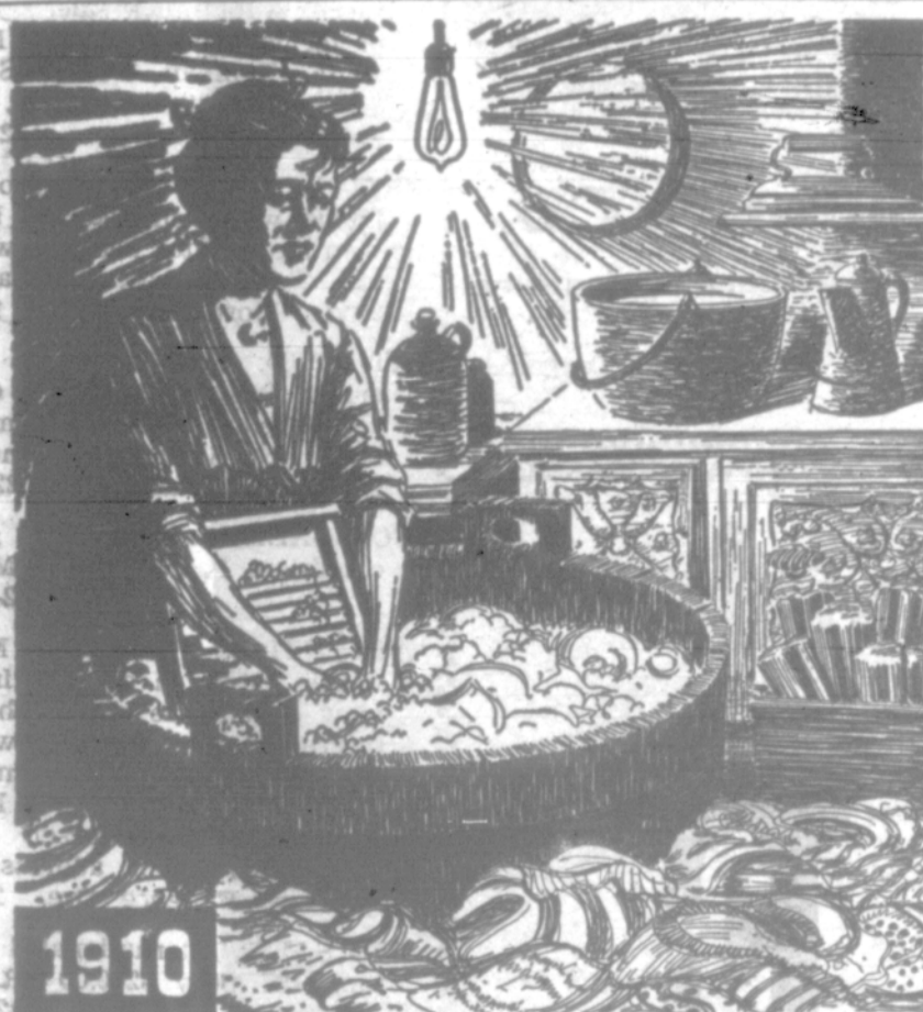
40 YEARS AGO, when Pacific Power & Light started in business, washday was a drudgery day! Electricity cost about 15c per kilowatt-hour, and was used mainly for lighting. Many Pacific Northwest communities had small local power plants which operated only from dusk to midnight. A big job lay ahead for pioneering Pacific Power & Light!