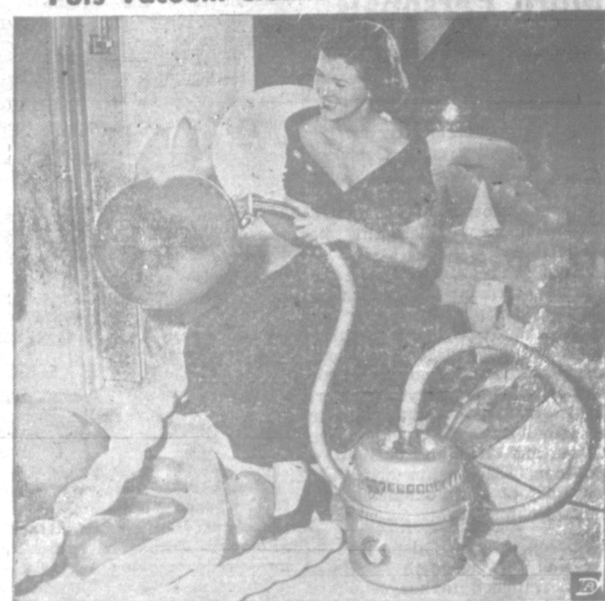
BROOKLYN, N.Y.—Blowing up balloons is just one of the thousand-and-one uses to which this Lewyt vacuum cleaner can be put. Preparing for a Valentine party, this wise young homemaker has attached the wide end of a common kitchen funnel to the end of the suction hose on the vacuum cleaner. The small end of the funnel is inserted into the balloon, the current turned on and, presto, the balloon is blown. One of the major features of the cleaner, which has seven attachments, is that it has no dust bag to empty.