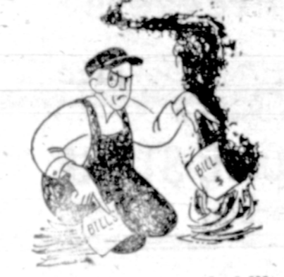
to cut down repair bills