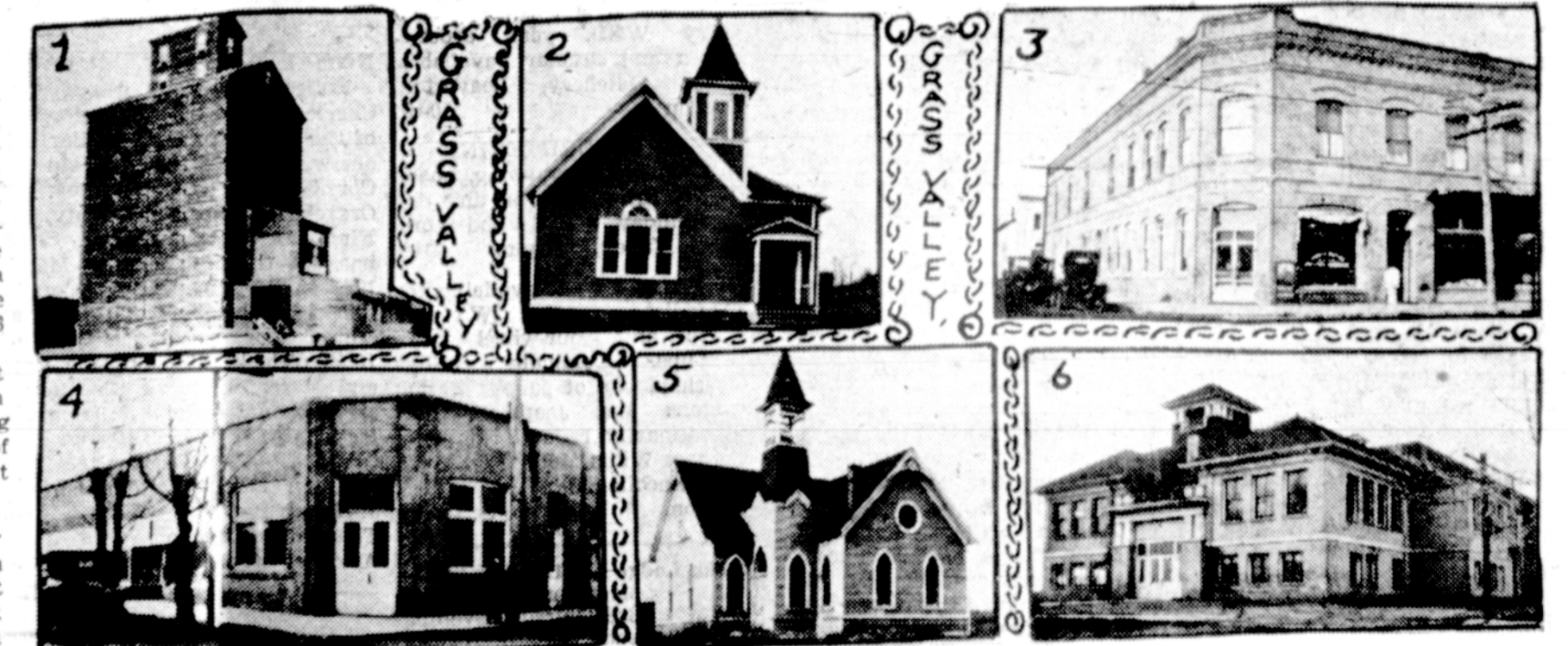
It was a long time ago when these pictures were taken and they give evidence of some damage during that time. But they will recall to those with gray hair, if any, what the towns looked like, back when.

Some are impatient to have spring, to see the old earth again, but farmers are content to have the snow remain until it can soak into the earth.