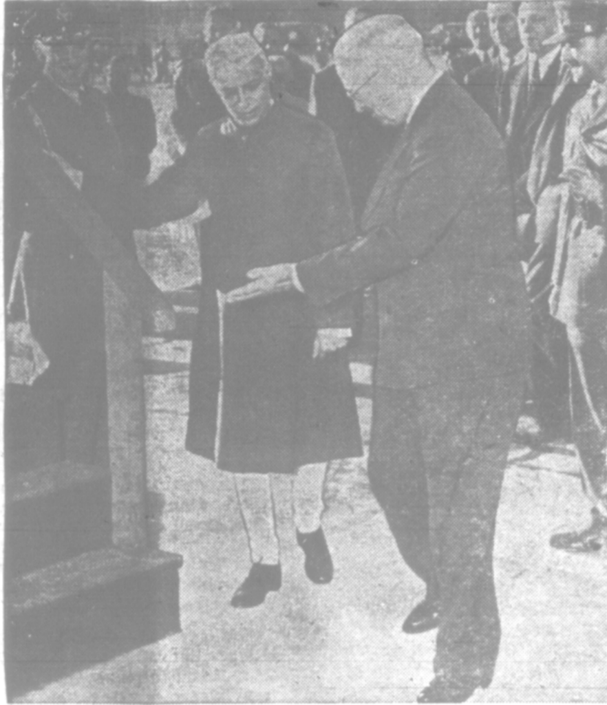
AFTER YOU, MY DEAR PANDIT . . . President Harry Truman steps aside and asks Pandit Nehru, India's prime minister, to precede him to speaker's platform at Washington national airport after the Indian leader's arrival in the United States. In his welcoming speech, Mr. Truman praised Nehru as "the loved and respected leader of a great nation of free people." Nehru said his nation would fight abridgement of liberty wherever it is found.

to be preceded by an oyster supper for Thursday, January 12. The supper will be held at 6:00 o'clock at the Legion hall and the installation later in the evening at the Oddfellow hall.