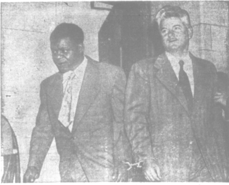
REVOLUTIONARIES . . . Two of the 11 Communist bosses convicted on charges of conspiring to overthrow the U. S. government by violence leave federal court in New York handcuffed together. They are Harry Winston (left), organizing secretary of the Communist party, and Eugene Dennis, general secretary. Each of the 11 faces maximum sentence of 10 years and $10,000 fine.