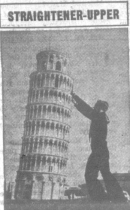
STRAIGHTENER-UPPER It's all in a day's work for a Navy Bluejacket. A crew member from one of the units of the Sixth Task Fleet lends a little support to the Leaning Tower of Pisa in the course of the Fleet's visit to the ports of northern Italy. Florence, Pisa and other Italian cities were on the sightseeing agenda as the Task Force brought the Naval version of America to Mediterranean shores.