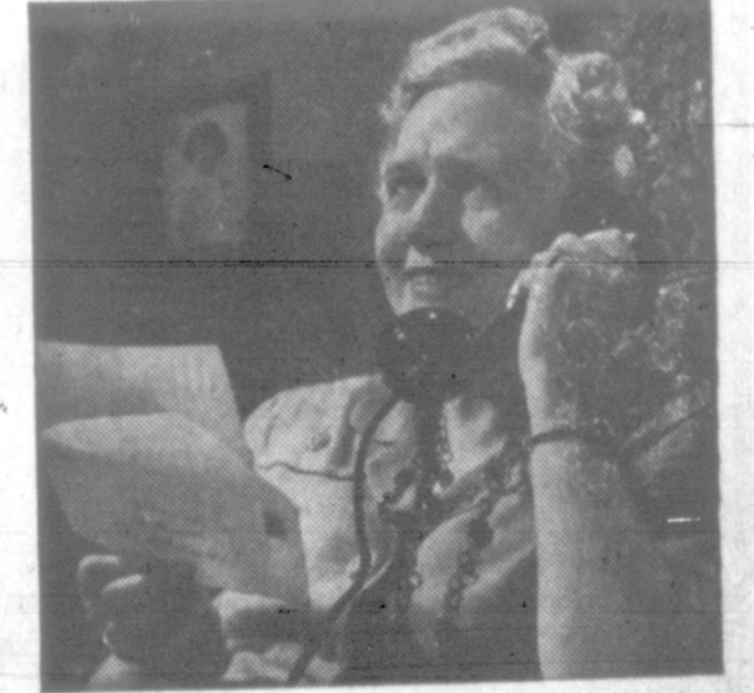
3. Someone calls your number... and, in a matter of moments, you pick up your receiver to answer. Perhaps the call is from just across the street. Perhaps it comes half-way around the earth. But your number guided it to your telephone... and no other. Seems almost like magic when you think of it... another of the little things that add up to good telephone service for you.