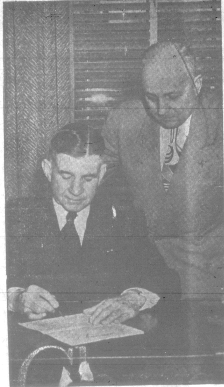
GOVERNOR BACKS EASTER SEALS

It is certainly hoped that sometime soon there will be a change in the department of agriculture that will bring some different thinking to American agriculture. We have to import wool and yet we subsidize wheat until light wheat land produces wheat and makes a surplus in that crop while we import Australian wool. Perhaps that is good foreign relations but it is poor domestic