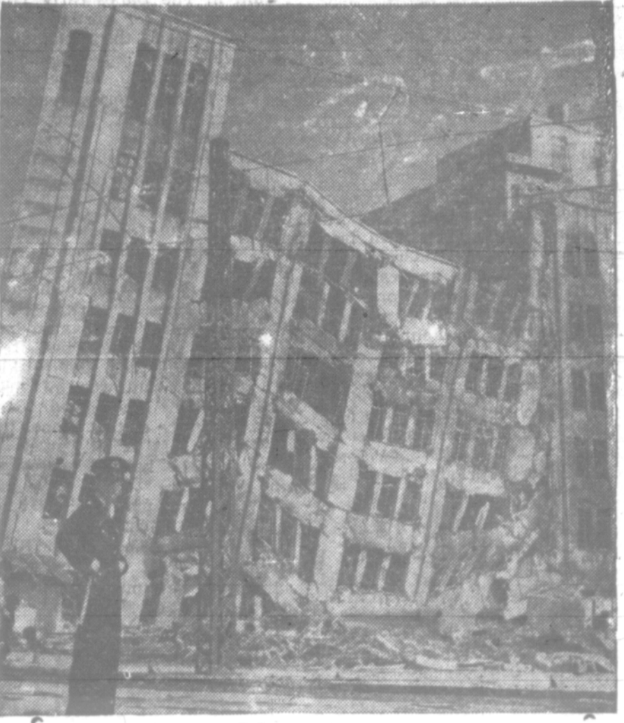
EARTHQUAKE LEAVES THOUSANDS DEAD . . . Atom bomb or no atom bomb, mankind has yet to devise a destructive weapon that can equal the stupendous forces sometimes released by nature. When one of the worst earthquakes of modern times hit Fukui, Japan, virtually the entire city was demolished and many thousands killed. Those few buildings that were left standing were burned out by fires that raged through the area.

Attorney at law MORO — OREGON Monday, Wednesday, Friday Afternoons THE DALLES 211 East Third Street Telephone 3209