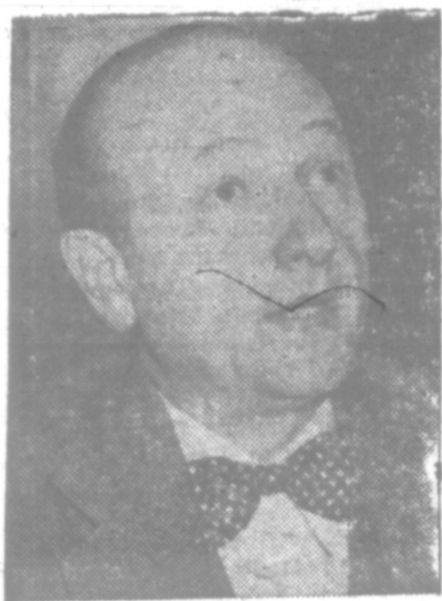
ATOM OF ADVICE . . . David E. Lilienthal, chairman of the atomic energy commission, told congress he favors outlawing strikes in atomic plants if that step should be necessary to insure continuous production.