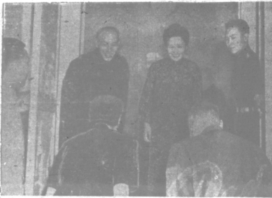
AFter ELECTION VICTORY... Despite warfare and Communists, they still were able to hold an election in China. Chiang Kai-shek was elected the first president of the new Chinese republic under the new constitution, and Gen. Li Tsung-Jen was elected vice-president. In the photo, the 59-year-old Gen. Li Tsung-Jen and his wife are shown bowing to President and Mrs. Chiang Kai-shek after visiting at their home and receiving congratulations.