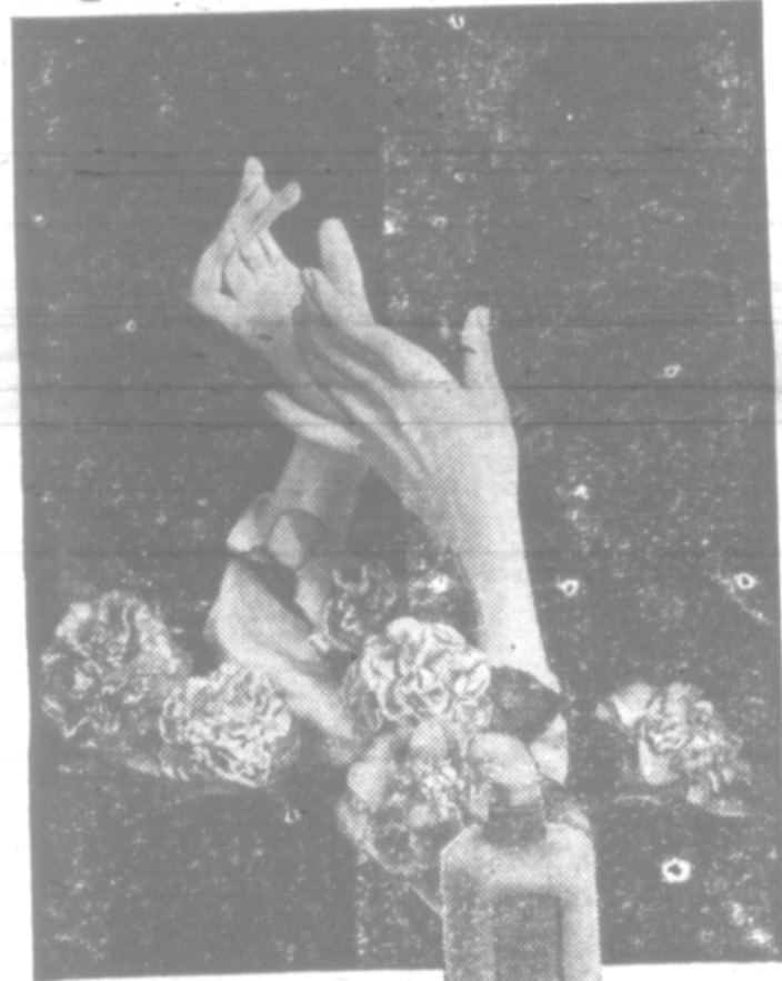
THE HANDS OF LILY PONS