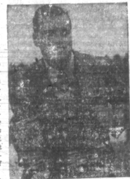
FOETIC JUSTICE . . . John B. Kelly Jr., of Philadelphia, whose father was barred from diamond sculls rowing classic in 1923 because he had done menial labor, saved family honor by winning the meet this year at Henley-on-the-Thames, England.