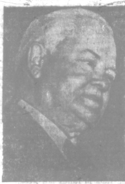
Ex-president Herbert Hoover, who recently celebrated his 73rd birthday at the home of his sons in California. He has been appointed on a congressional committee to study executive expenses, the duties of which will soon occupy his time.

THE DALLES 211 East Third Street Telephone 3209