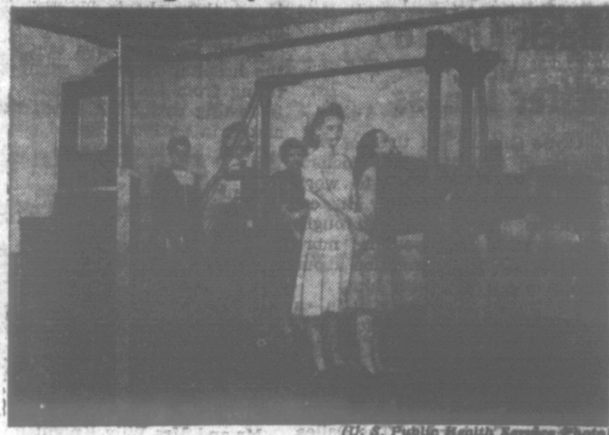
With the new improved equipment, X-ray pictures of the lung require only a few seconds and can be taken with "clothes on." Group X-ray programs, to find unknown cases of tuberculosis while the disease is still in its early and most easily curable stage, are sponsored by tuberculosis associations from Christmas Seal funds.

Anytime you discover that neither your enemies or your friends are saying unkind things about you, you have reason to be alarmed. You may be dead and not know it.