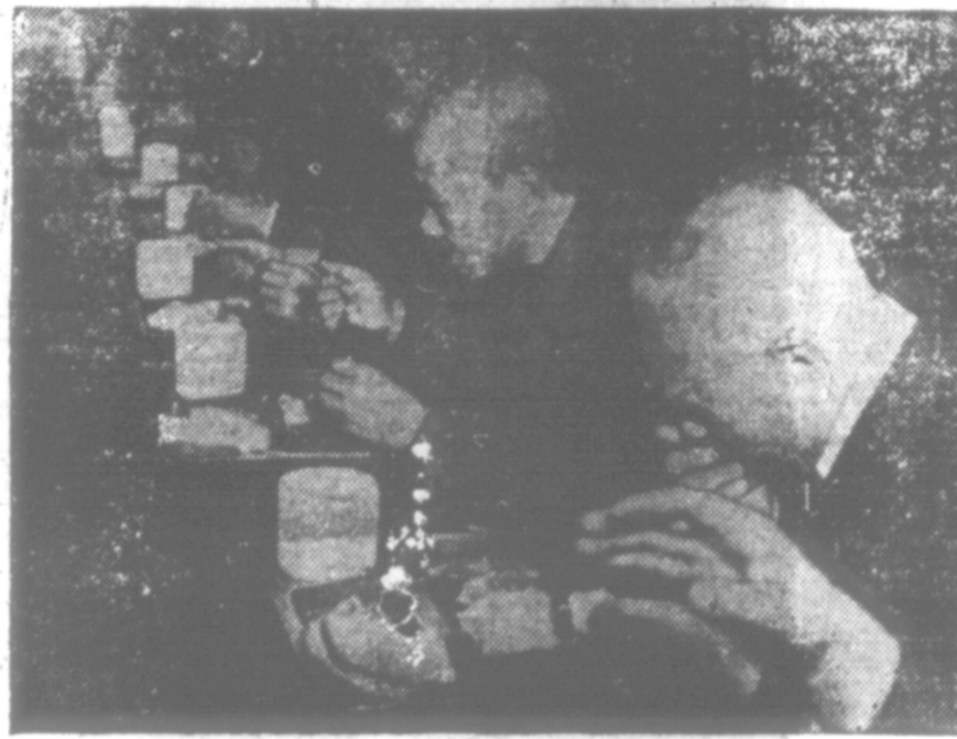
TOJO AND PALS EAT LUNCH . . . No coddling here. When lunch time comes at the trial of the Jap war criminals in Tokyo, ex-premier Tojo and other defendants are served their meal in regular G.I. mess kits and eat seated at a long bench, facing a wall and heavily guarded by American MPs. Tojo is the second man in the photo, with spectacles lying on table in front of him.