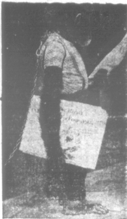
CHAMP NEWSBOY... Believed to be the best trained monkey in the United States, "Kip," a chimpanzee from Dania, Florida, plays the role of newsboy at a Miami street corner. Sales soared that day.