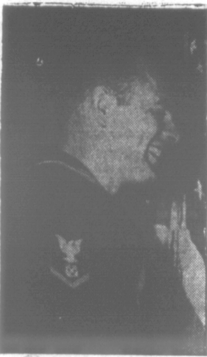
NO-HIT ACE . . . Johnny Vander Meer, former Cincinnati pitcher of 20-hit fame, photographed as he was discharged from the navy. The southpaw is now 31 years old.

How would you like to step into a job that gives you good pay . . . gives you an opportunity to study one or more of 200 skills and trades, including such advanced sciences as aviation, radar, television, electronics, radio, jet propulsion, atomic science . . . permits you to travel to the far corners of the world . . . gives you 30 days' vacation with pay a year? A 3-year enlistment in the Regular Army means that you can choose your arm or branch of service and your overseas theater. It means thorough training in the skill of your choice. And it means that, under the GI Bill of Rights, if you enlist for 3 years, you may have 48 months of college, or business or trade school education, with tuition up to $500 per ordinary school year paid and $65 a month living allowance ($90 if you are married) paid by the Government. WORLD TRAVEL! COLLEGE EDUCATION! INVESTIGATE TODAY! NO OBLIGATION Match this against other opportunities open to you today. It's one you can't afford to miss! Get all the facts at your nearest Army Recruiting Station. POSTOFFICE BUILDING Phone 3926 THE DALLES