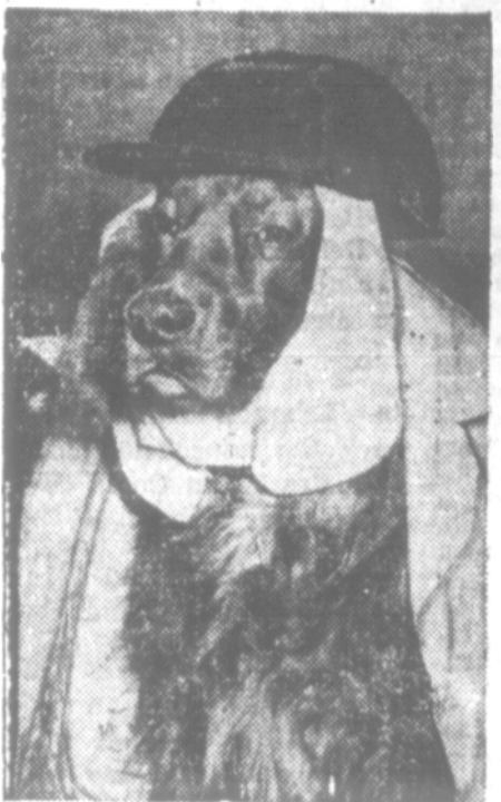
SEITEN' PRETTY . . . This Irish setter, of high degree, has no use for weather of low degree. So when the temperature hit eight below, he 'ld something about his comfort. His master's hunting cap and muffler came in mighty handy.