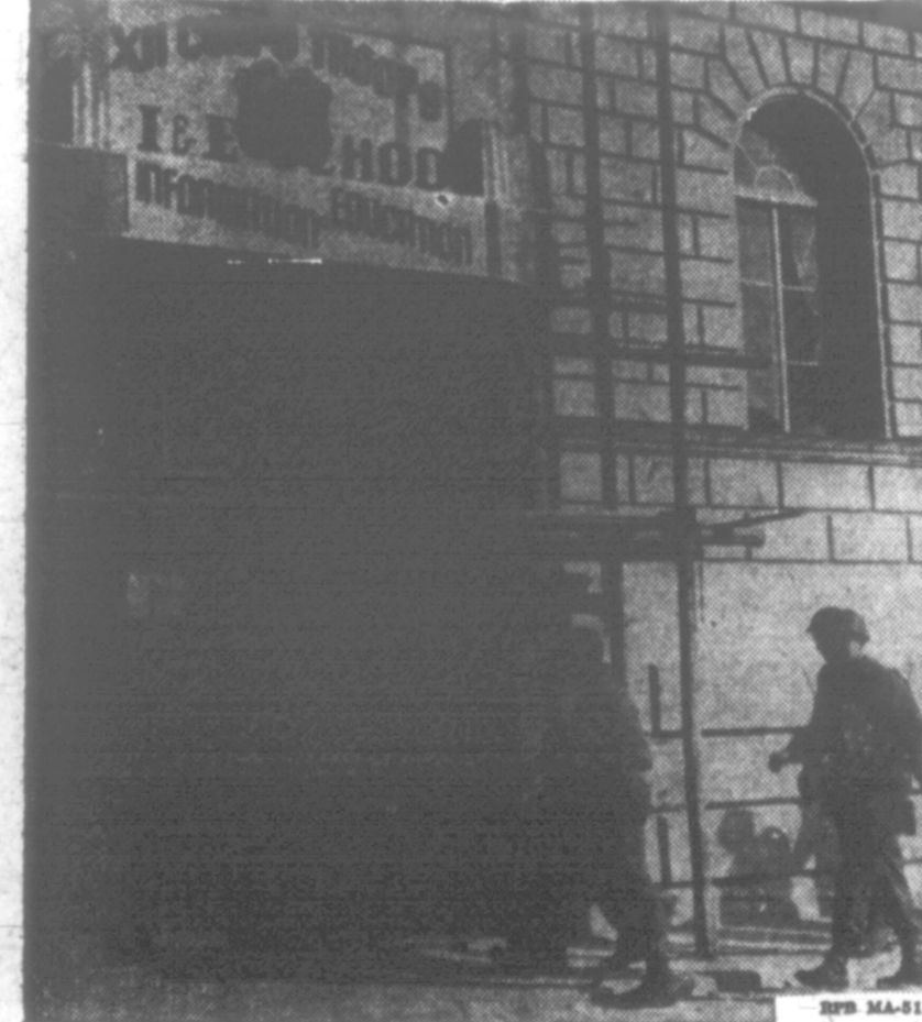
Text books in hand, American soldiers serving an occupation program enter the school opened for them under the U. S. Army Education Troops in Regensburg, Germany. Education and trade training are two of the inducements offered to those who enlist in the Regular Army. Qualified civilians 18 to 24 years of age, inclusive, now can enlist at any U. S. Army Recruiting Station.