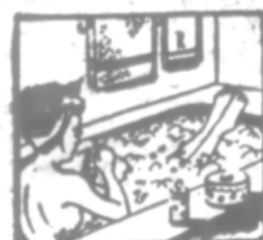
SOFT WATER makes Bathing and Shampooing a Delight.

Now you can get a Water Conditioner that operates on ANY water pressure between 5 and 100 pounds!