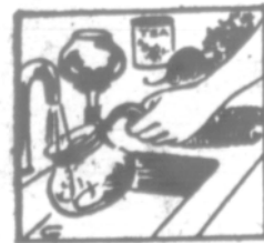
Tea, Coffee and Vegetables Taste Better When Soft Water is Used.