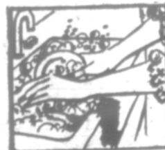
Hands Keep Soft—Clothes Come Cleaner, Last Longer.