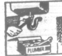
Save Soap, Chemical Softeners and Plumbing Bills.

SOFT, clear, pure water is no longer a luxury for the few, but a necessity that can be enjoyed in EVERY home!