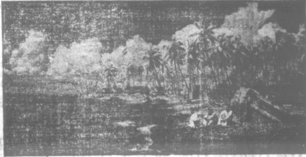
The three years since August 7, 1942, when United States Marines landed on Guadalcanal to open the Pacific offensive, have produced many changes on that Solomon island. Now, Red Cross girls and Leathernecks (upper left) swim and sun themselves at leisure. A short time ago, swimming and bathing came under the heading of "hazardous occupations" and a Marine machine-gunner (lower left) guarded his buddies from Jap intrusions as they washed in Guadal waters.