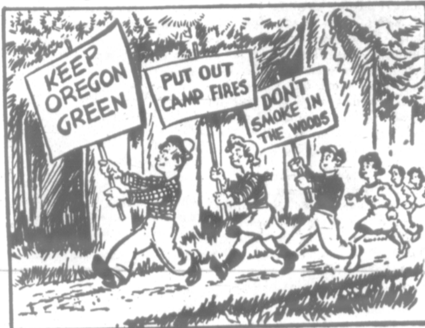
An army of 23,000 teen-age boys, girls in the Oregon Green Guard, pledge to KEEP OREGON GREEN. Are you observing the rules of common sense? Appoint yourself a fire warden! Keep Oregon Green Association—Salem, Oregon

day and will spend a few days here with his family before reporting again for duty.