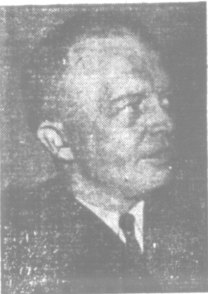
Comdr. Harold E. Stassen, former Republican governor of Minnesota, who was named by President Roosevelt to the United Nations conference at San Francisco. He was recently decorated for his naval work.