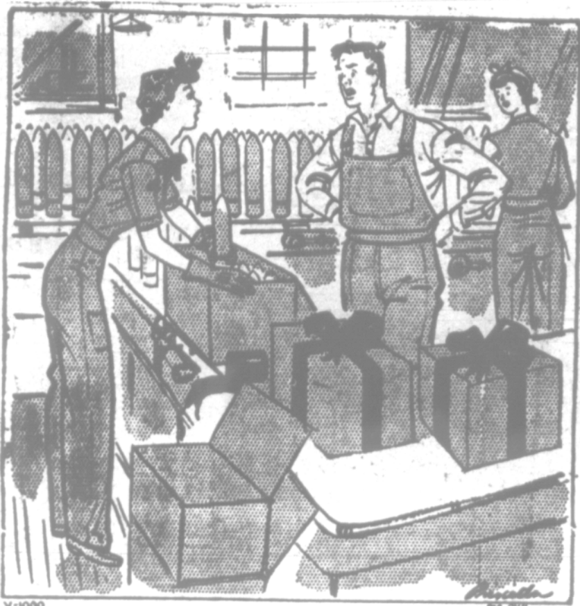
"MISS PARKER, THIS IS WAR - NOT CHRISTMAS!"